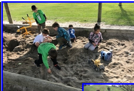
Creative construction in the sandpit!