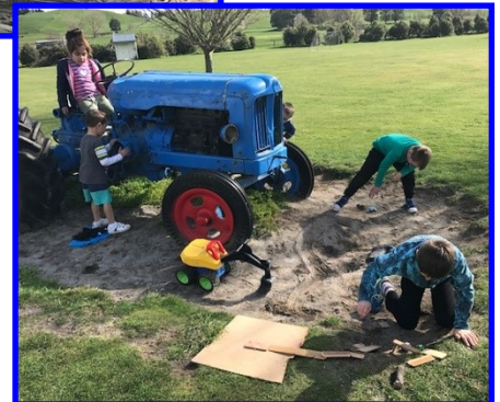
Fun on the tractor at lunch time!